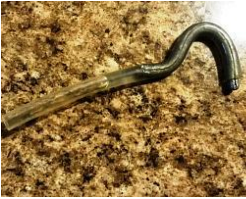
Lead now removed note tubing retains the formed shape